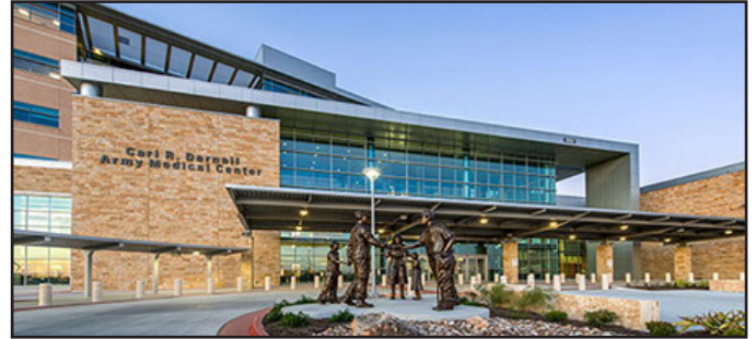
Huntsville Center's Initial Outfitting & Transition Team supported the largest Army replacement hospital opening to date, measuring just less than 1 million square feet and requiring 30,000 new items to support the first patient day in 2016.