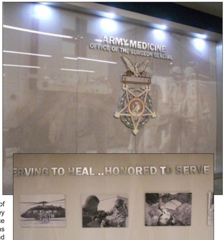
Signage and graphics installed at the Office of the Surgeon General in Falls Church, Virginia.

Orders for other furniture and artwork are typically executed through GSA schedule contracts with vendors that can provide multiple types of furniture and furnishings. Pricing is based on prices established within the associated GSA schedules and can be executed for both continental United States and overseas requirements.