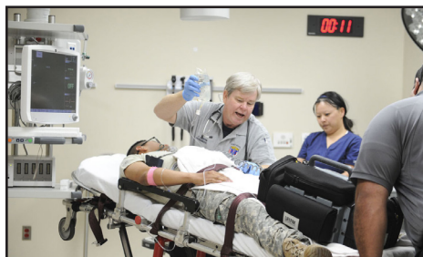
Paramedics and emergency department staff rush in a volunteer patient for a simulated trauma case during the Carl R. Darnall Army Medical Center "Day in the Life" event preparing the staff for the new facility.